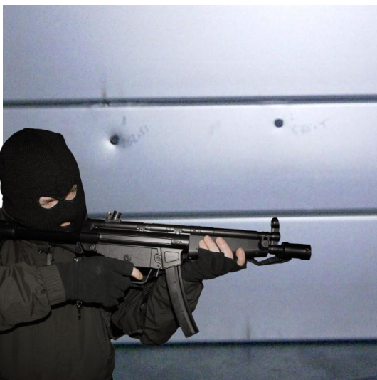
100 mm high BULLETPROOF slats. FB6-S level

Maximize your relief using our burglarproof and bulletproof certified roller shutters.