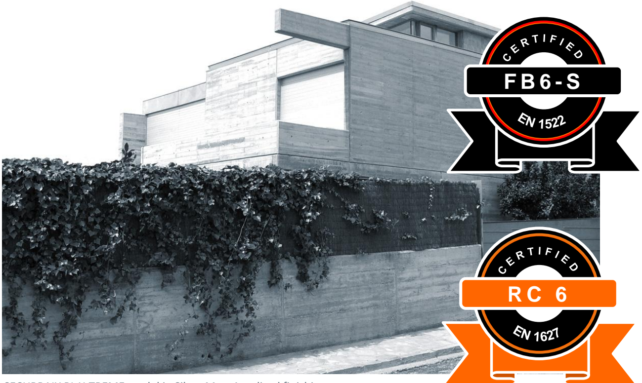
SECURBAIX BL X-TREME model in Silver Matt Anodized finishing

Maximum BULLETPROOF and BURGLARPROOF protection